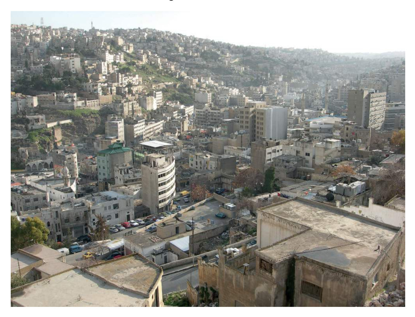
Fig. 1.2 for Question 1